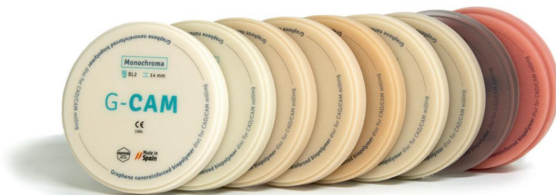
Fig. 3. Various available shades of the G-CAM disc